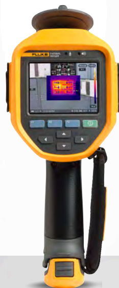
Fluke Ti480 PRO Infrared Camera